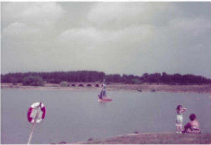
Early days - look how little vegetation there is!