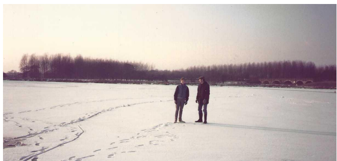
The Wiles' on the lake ice - do not try this at home!