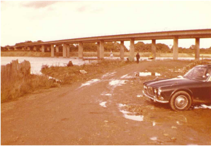
Before the fence and no car park