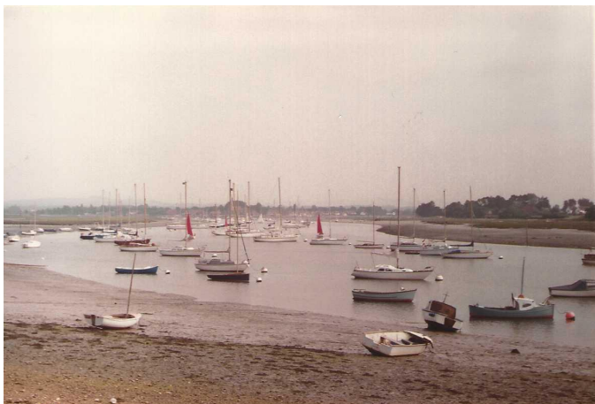
Not a lot has changed over the years at Cobnor