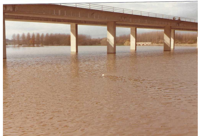
Above three pictures: Floods!