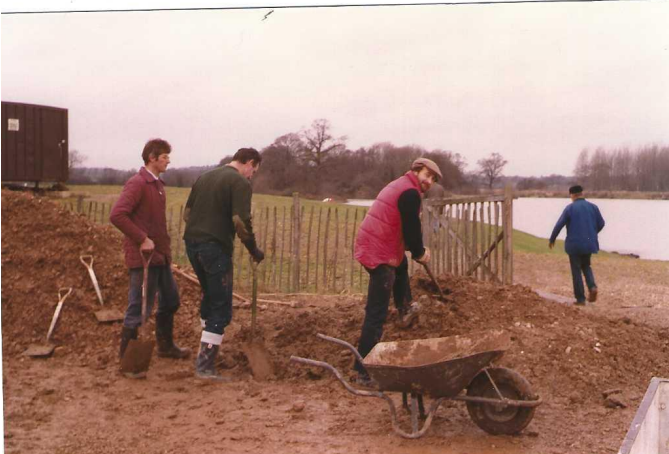
Above three pics: Now THAT'S what's called a working party!