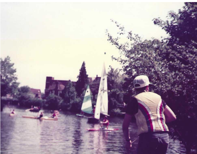
Sailing on the Medway at the River Festival